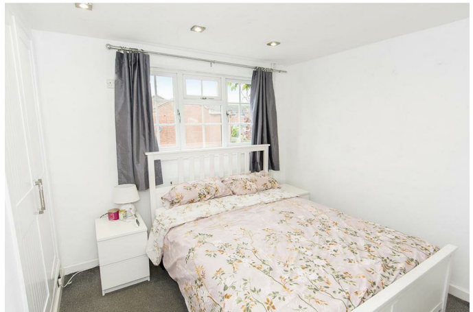
Bedroom One 9'9" x 8'8" (2.97m x 2.64m)

A double bedroom with a window to the front aspect. The bedroom benefits from a built in double wardrobe and a radiator.