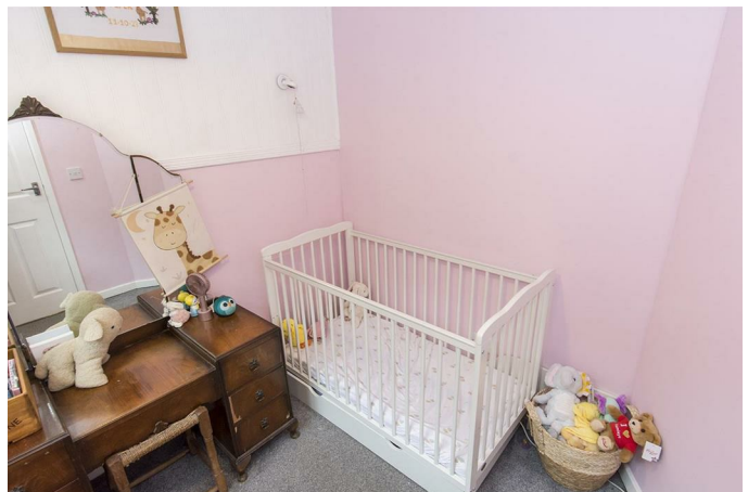
Bedroom Four 6'6" x 7'2" (1.98m x 2.18m)

A single bedroom with a window to the rear aspect that also overlooks the garden and a radiator.