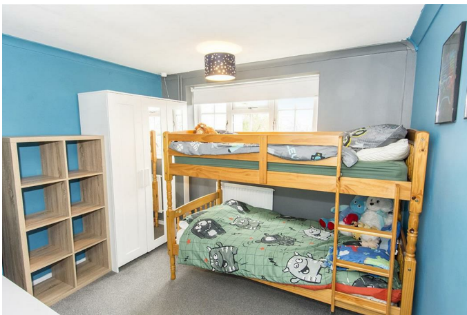
Bedroom Two 10'10" x 10'2" (3.30m x 3.10m)

A double bedroom with a window to the front aspect and a radiator.