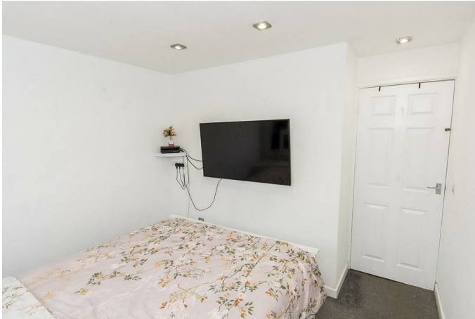
Bedroom One (Photo Two)